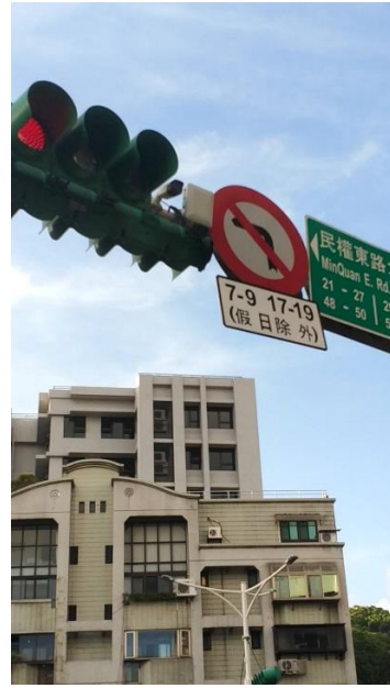
Warning system for collisions difference between inner vehicle wheels @Zhongli District, Taoyuan City