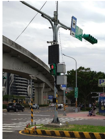
Warning system for sidewalk riding @Neihu District, Taipei City