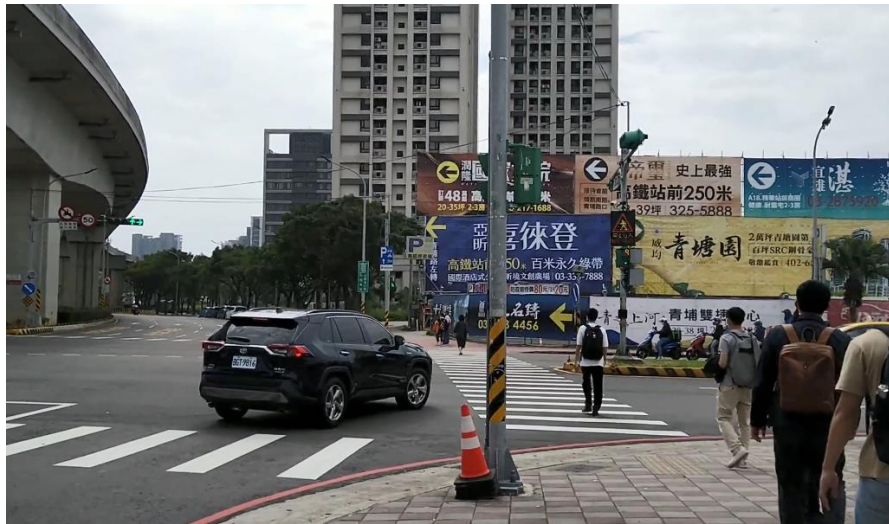
Warning system for collisions difference between inner vehicle wheels @Neihu District, Taipei City