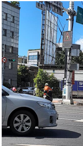
Warning system for failing to yield to pedestrian @Zhongli District, Taoyuan City