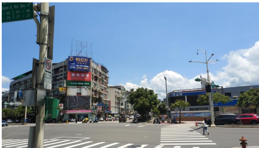
Warning system for collisions difference between inner vehicle wheels